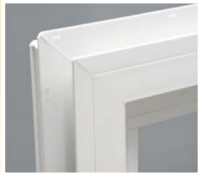
Integral nail fin and J-Channel