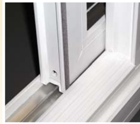
Vinyl threshold cover