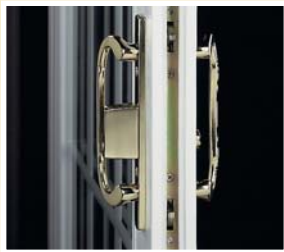
Optional brass hardware