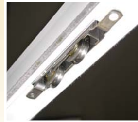
Stainless steel tandem rollers and hardware